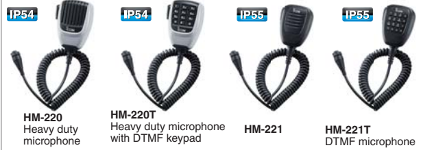
HM-220 Heavy duty microphone