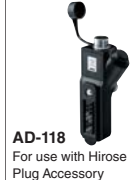
AD-118 For use with Hirose Plug Accessory